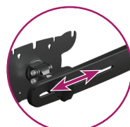
Easy mount adjustment