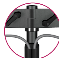
Cable management and height adjustment